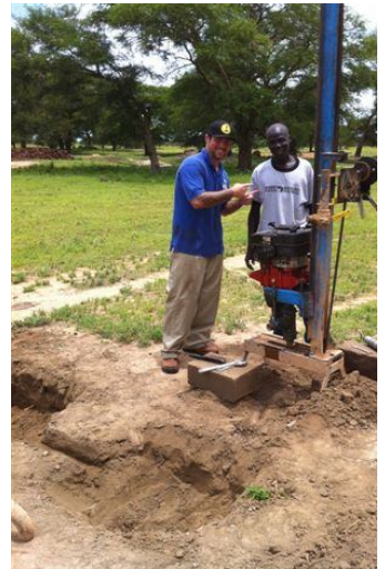
Bore Hole being installed