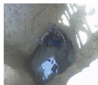
Drinking Water Well

We have also purchased a 40ft shipping container that has been loaded with over 100 school chairs 50 school desks 9 hospital beds (donated by the Walkerville Rotary Club), a 17hp generator, arc welder, rio bar cutter as well as heaps and heaps of hand tools. Several schools also donated exercise books and stationery in huge proportions as well as sporting equipment. We also managed to get several bikes and heaps of clothing.